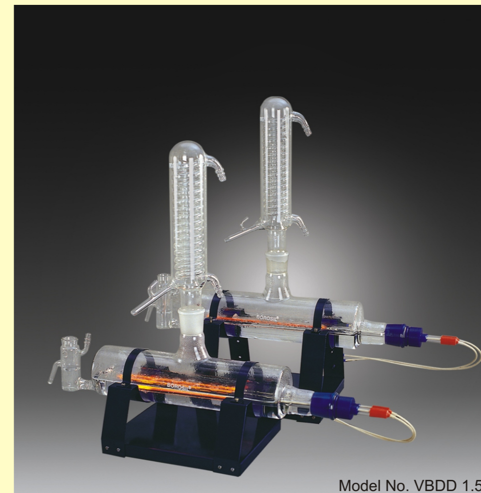
Model No. VBDD 1.5L

Note: Distilled water is free from metal ions and bacteria. Hence it is difficult to measure pH and conductivity values. Use of soft water is recommended to prevent scaling in the boiler and to improve quality of distillate.